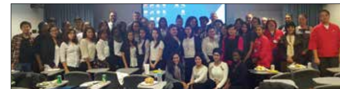
NYEE Volunteer Holiday Celebration

Our volunteers are committed to providing the best experience possible for all of our visitors, and have begun taking classes to learn communication skills that will help them demonstrate care, concern, and compassion, both through their body language and their words.