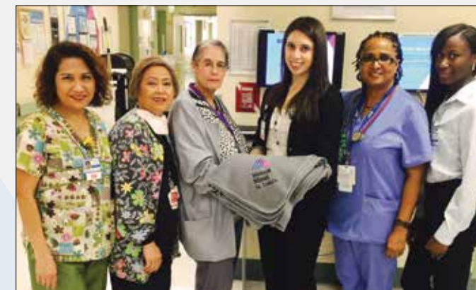
Mount Sinai St. Luke's 7W Patient Care Team