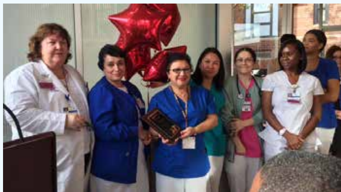
The 3 North Patient Care Team

In the spring of 2015, more than 500 Mount Sinai Brooklyn employees worked together to develop and define the "Mount Sinai Brooklyn Way"—service standards that all employees must consistently demonstrate so patients and visitors have the best possible hospital experience. The service standards defined by the Brooklyn team are: Helpful, Caring, and Compassionate.