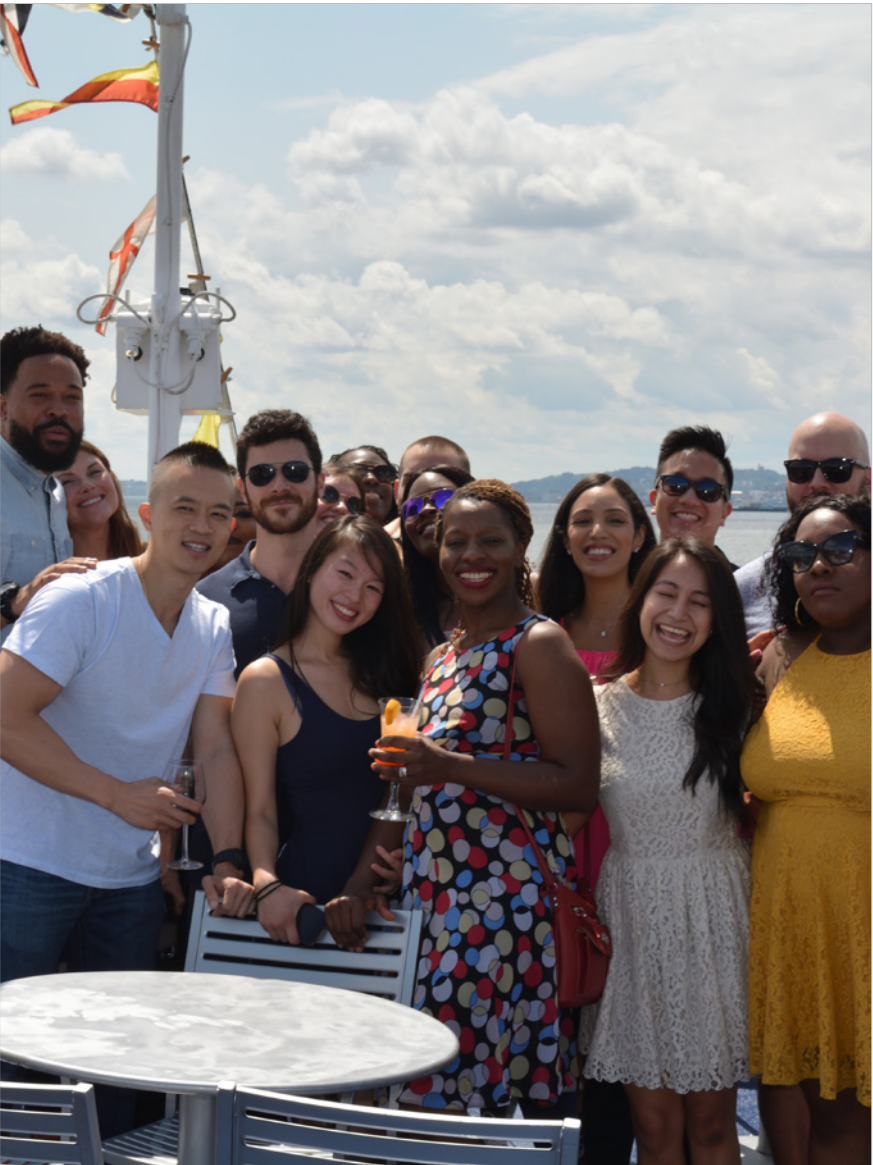
Graduation Luncheon 2018, Spirit of New York Cruise Ship

Pre-entry Immersion Program A pre-entry program is offered free of charge to all interested incoming and continuing students. The immersion program consists of workshops that focus on topics including, but not limited to: study and note-taking skills; time management; professional writing; and medical terminology. Immersion programs have proven to be an effective way to support student success. Please contact the Office of Admissions ( maria.gallo@mountsinai.org ) for further information about when the next session will be offered or to enroll.