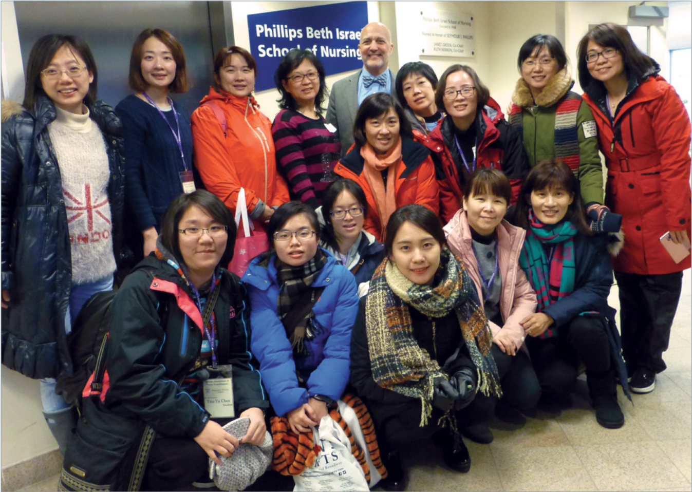
Faculty and Student Exchange 2017, National Taipei University of Nursing and Health Sciences

PSON provides students and faculty with an opportunity to visit other countries and experience other health care systems through two innovative programs: