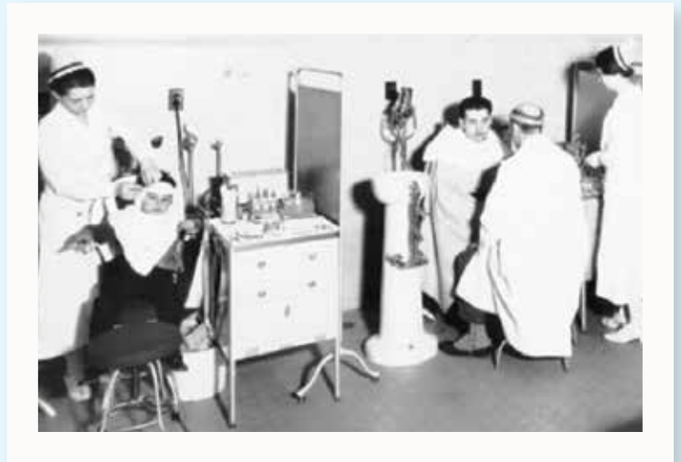
PHOTOS: (Upper) A European physician and his family arrive at Ellis Island, looking forward to a new life in New York City, in an undated photo; (Lower) Mount Sinai Outpatient Clinics during the 1930s provided employment for refugee physicians and nurses.