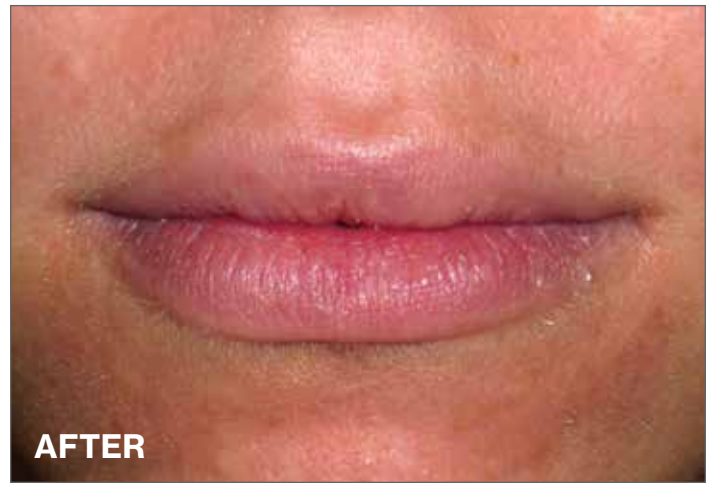
A patient of Dr. Zeichner before and one week after lip rejuvenation with Juvéderm® Ultra XC filler. Note the improvement of symmetry and the enhanced fullness that is balanced among the vermilion border, upper lip, and lower lip.