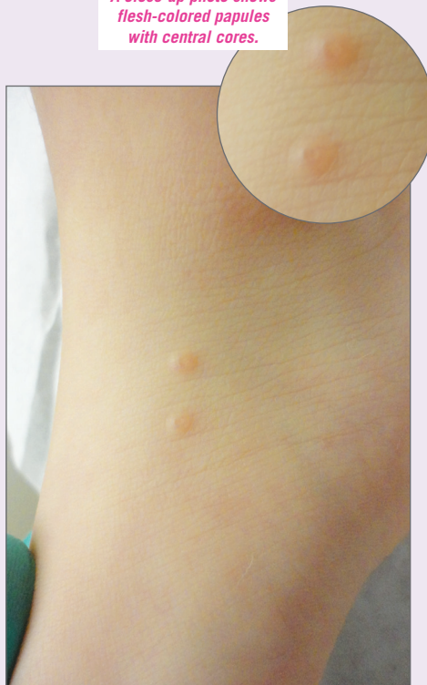
Molluscum contagiosum is a viral infection of the skin.

A close-up photo shows flesh-colored papules with central cores.