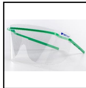
TIDI Shield Eyeshield and Frame – 9210A-100 Grab N' Go