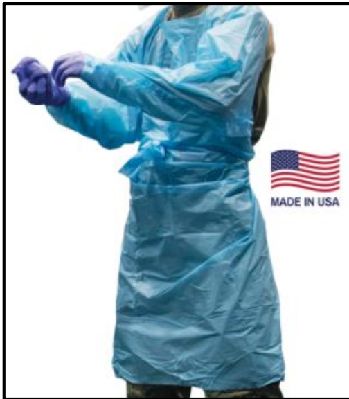
Lamart LAMART50 (COI- 8078LAMART50)

All gowns below have been approved for use by MSHS with special droplet precautions.