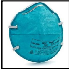
3M 1860s Health Care Particulate Respirator and Surgical Mask - Small