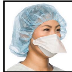
Halyard 76827 Health Care Particulate Respirator and Surgical Mask - Small