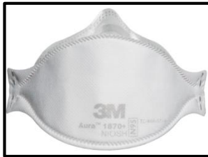
3M 1870 Health Care Particulate Respirator and Surgical Mask NOTE: As New Fit Testing Permits