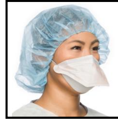
Halyard 76727 Health Care Particulate Respirator and Surgical Mask - Regular