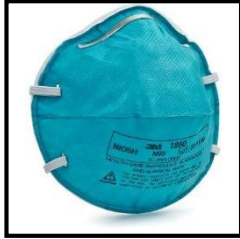
3M 1860 Health Care Particulate Respirator and Surgical Mask

All respirators below have been approved for use by MSHS with special droplet precautions.