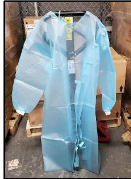
ESS MLCGXL (COI- 8078MLCGXL) Level 2 Gown