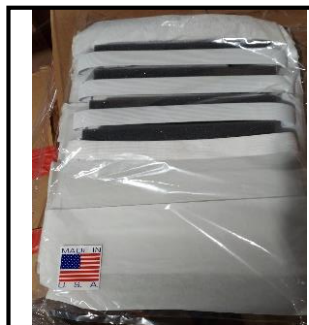
Shield Our Heroes NYC FS001.008PTGSW (COI-8078008PTGSW) Face shield with foam headband and 'Made in the USA' sticker

All face shields below have been approved for use by MSHS with special droplet precautions.