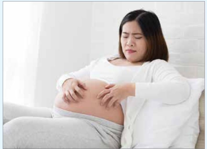
Up to 20 percent of pregnant women suffer from itching and skin rashes.

There are numerous other causes of itching and skin eruptions during pregnancy. The timing of onset, appearance, and distribution of the rash are important diagnostic signs. The dermatologist plays a key role in diagnosis and prompt treatment, which are crucial to protect the mother and her baby.