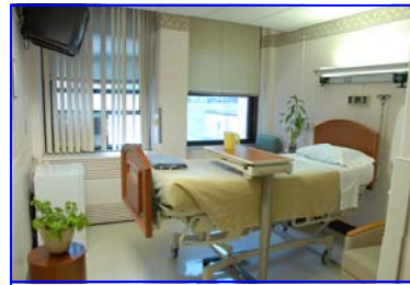
Private room on KP5 (above)

notified of your birth and will examine your infant within 24 hours. If you do not have a pediatrician with privileges at Mount Sinai, one will be selected by your obstetrician.