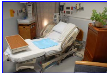
L&D Birthing Room

The triage area is a shared room where you are initially examined. The fetal monitor will be used to assess your contractions and your baby's heart rate. Your doctor or midwife will make the decision to admit you or send you home.