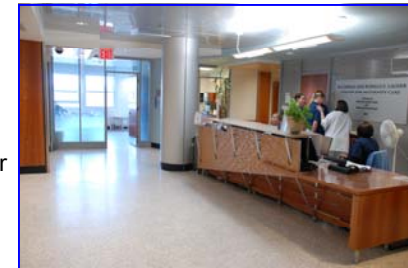
Newly Renovated Post Partum Floor

The mother/baby units on the 7 th and 8 th floors each have 11 private rooms and