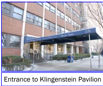
Entrance to Klingenstein Pavilion

Welcome to The Mount Sinai Hospital online Maternity tour. The Klingenstein Pavilion is home to the Kravis Women's Center and all childbirth related services. We are located at 1176 Fifth Avenue between 98 th and 99 th Streets. For your convenience, Mount Sinai has a visitors parking garage located on 99 th Street between Madison and Park Avenues.