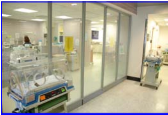
State-of-the-Art Nursery Unit

5 semi-private rooms. All rooms have bathrooms with showers. The 5 th floor mother/baby unit is also home to our high risk antepartum unit. There are 5 private rooms available with showers and a number of semi-private rooms.