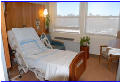
Private Room w/ 5th Avenue View

assist mothers and babies with breastfeeding difficulties. The nurse caring for you is able to assist you with positioning and latching and has been educated to do so.