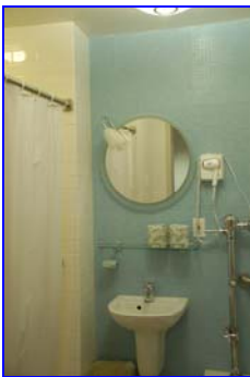
Private walk-in bathroom equipped with amenities

Once your room is assigned, and your recovery is complete, you and your baby will be transferred to one of our three mother/baby units. Upon arrival to the mother baby unit, you will be taken to your room and your nurse will examine you. The baby is admitted to the newborn nursery for a period of time and examined by a nurse there. Your pediatrician will be