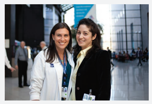
RMTI Transplant Dieticians