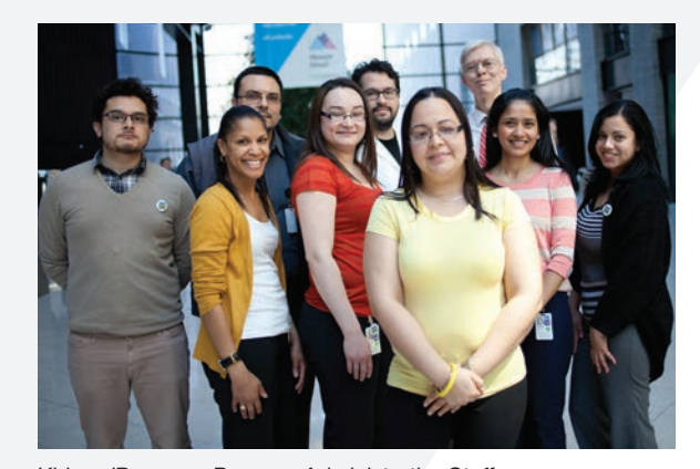
Kidney/Pancreas Program Administrative Staff