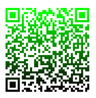
Scan for list of existing users