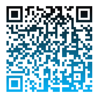
Quick start guide